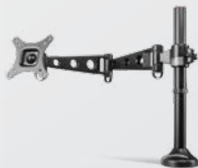
ThinkCentre® Extend Arm