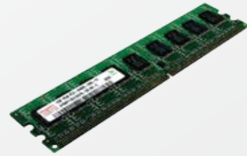
PC3-12800 DDR3-1600 UDIMM Memory