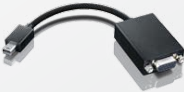
DisplayPort to Dual-DisplayPort Monitor Cable