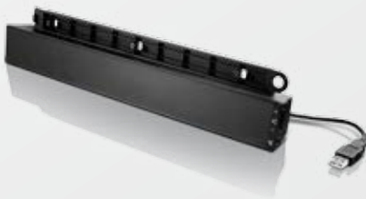
Lenovo® USB Soundbar