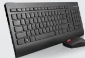
Lenovo® Ultraslim Wireless Keyboard and Mouse Combo