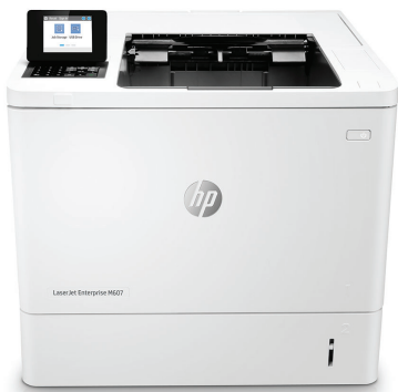
HP LaserJet Enterprise M607dn